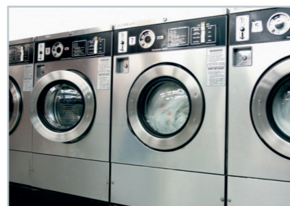
Household Electrical Appliance