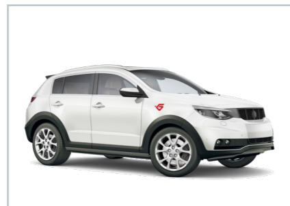
Automotive & Truck